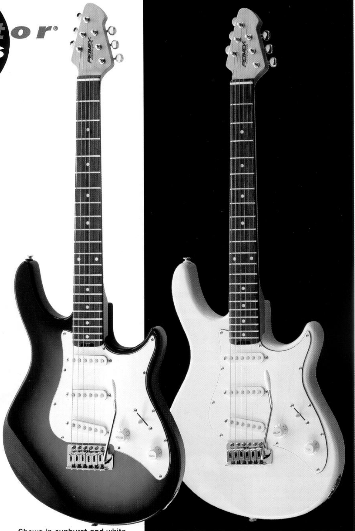
Shown in sunburst and white

Colors: Black, Sunburst, White, Metallic Garnet Red